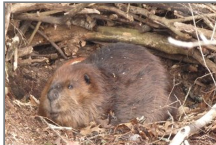
Beaver in emergency shelter, spring flood 2014.