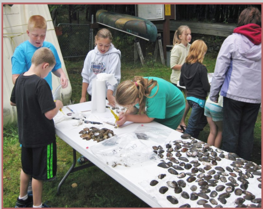
Fifth grade students sort freshwater mussels by species and measure valve length during the Students' Environmental Monitoring Project.

The Refuge offers many varied programs throughout the year for the public, school groups and special interest groups.