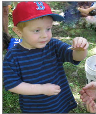
In awe of fish!