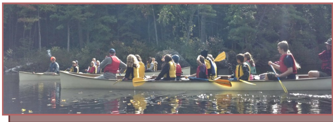
Students' Environmental Monitoring Project

The size of the Refuge ensures that diverse groups of plants and animals can thrive and bring to the next generations the thrill of undisturbed nature.